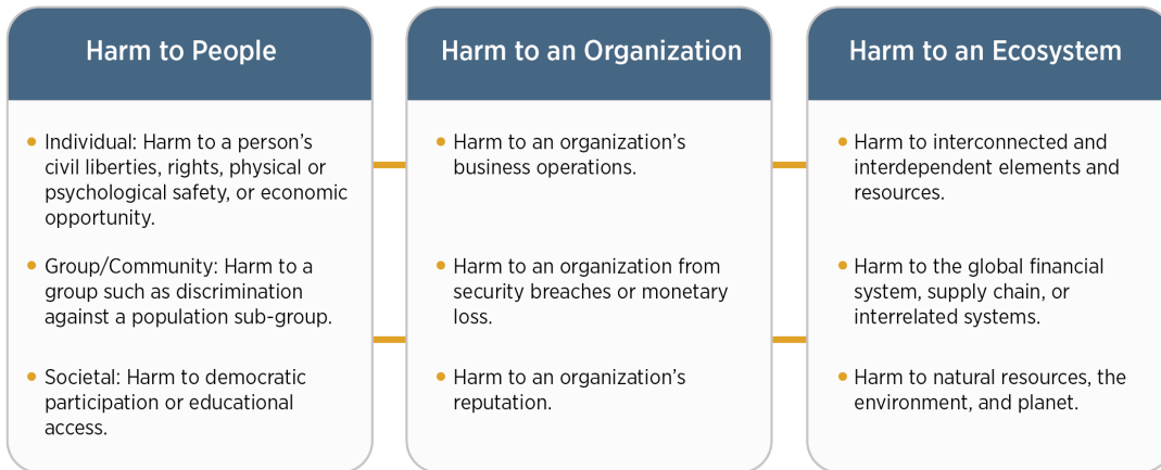
Fig. 1. Examples of potential harms related to AI systems. Trustworthy AI systems and their responsible use can mitigate negative risks and contribute to benefits for people, organizations, and ecosystems.